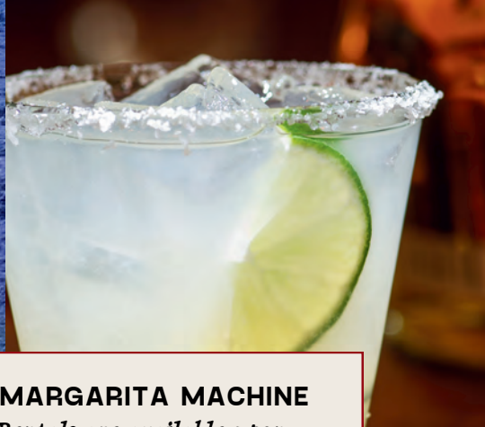
MARGARITA MACHINE Rentals are available upon request