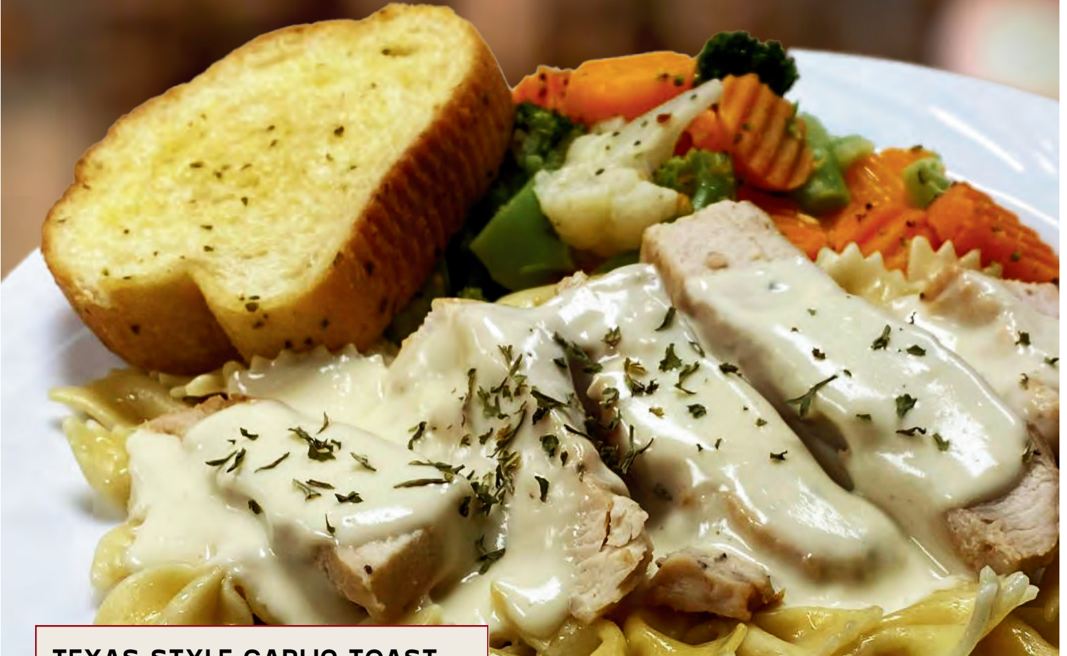
TEXAS STYLE GARLIC TOAST