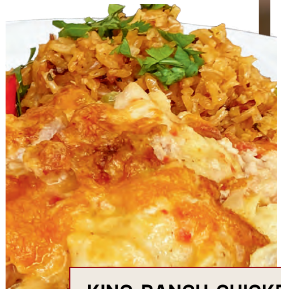
KING RANCH CHICKEN